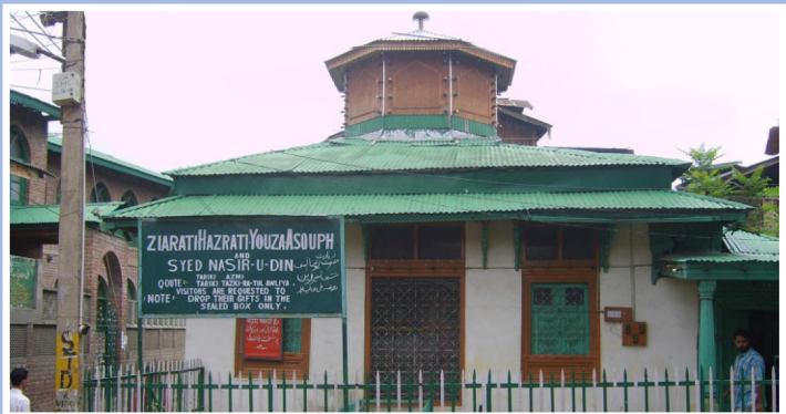
Tomb of Jesus Christ Srinagar, Kashmir, India

This is an English version of an Urdu treatise written by the Holy Founder of the Ahmadiyya Movement in Islam, Hadrat Mirza Ghulam Ahmad (1835-1908). The theme is the escape of Jesus from death on the cross, and his journey to India in search of the lost tribes of Israel. Christian as well as Muslim scriptures, and old medical and historical books including ancient Buddhist records, provide evidence about this journey. Jesus is shown to have reached Afghanistan, and to have met the Jews who had settled there after deliverance from the bondage of Nebuchadnezzar. From Afghanistan Jesus went on to Kashmir, where other Israelite tribes had settled. There he made his home, and there in time he died; his tomb has been found in Srinagar.